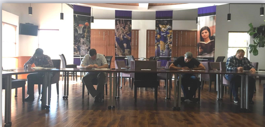
The New Mexico State Board of Professional Engineers and Professional Surveyors proctored the two-hour State Specific Exam on June 2, 2017 in Las Cruces, NM.

The New Mexico Board of Licensure for Professional Engineers and Professional Surveyors would like to congratulate the following recent examinees who received passing scores on the Practice of Surveying exam. Their dedication to completing the path to professional licensure in New Mexico sets provides leadership for the future of surveying in our State.